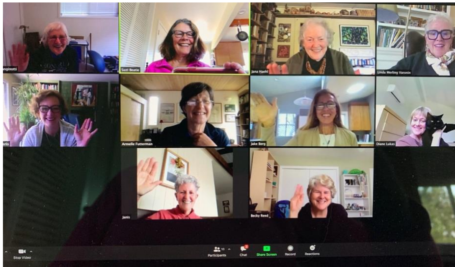
Friendly faces during a Zoom meeting.